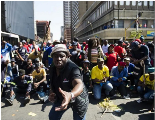
Public sector workers on strike in 2022

29 May offers no prospect for change for the working class and poor in South Africa exactly 30 years after formal political independence. Several political developments have taken place in the lead up to the elections key among them being the formation of the reactionary “Moonshoot” Multi Party Charter led by the Democratic Alliance (DA), the formation of the Mkonto WeSizwe party (MKP) by former president, Jacob Zuma, at the head of remnants of the Radical Economic Transformation (RET) faction of the ruling African National Congress (ANC) and, significantly, the formation by AMCU of a Labour Party (LP).