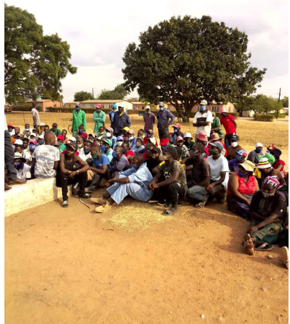
Striking workers at an Agro-processing company meeting to consolidate the strike in September 2021