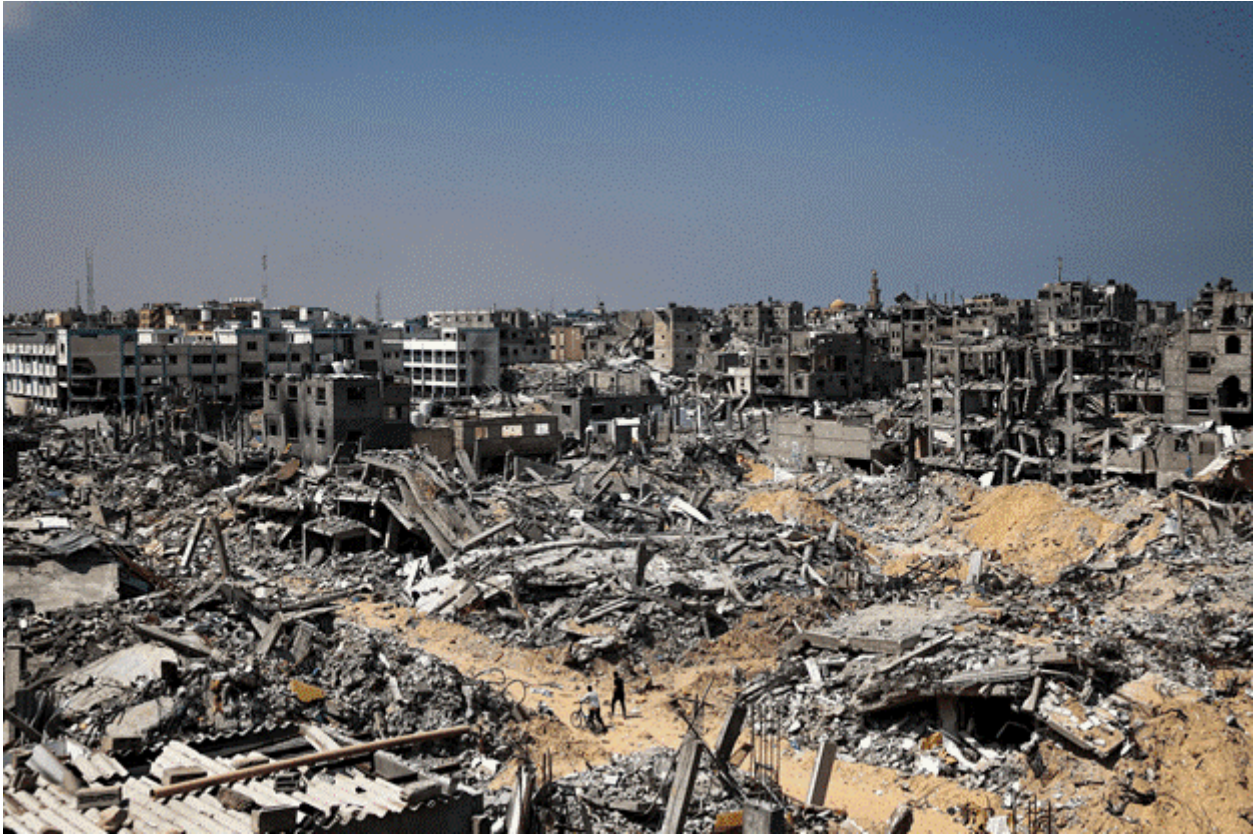
Walking in Khan Younis, in the southern Gaza Strip, on April 16.

The Gaza genocide, unlike past genocides like that of the Congo, is being watched on smart phones around the world. The Zionist propaganda machine reveals itself as ‘white washing’ the colonial settler state and its 75 year project of Palestinian expulsion. The Zionists claim that any criticism of the Zionist state is anti-semitic and based on Jew hatred. This lie has been exposed in the streets in ten thousand demonstrations around the world where anti-Zionist Jews join arm in arm with Palestinians and their millions of supporters to oppose the genocide. The Western world bourgeois regimes have lined up behind the genocidal strategy, while the rest of the world is screaming its support for the Palestinian bourgeois democratic right to self-determination. The means to fight genocide is limited only by the fact that workers lack a world party of socialist revolution which turns Palestinian national liberation into the cause for the global overthrow of the rotten and corrupt capitalist system which can survive only by means of genocide. The crisis of the survival of humanity as a whole comes down to the crisis of revolutionary leadership of the working class, ending capitalism and creating a socialist world.