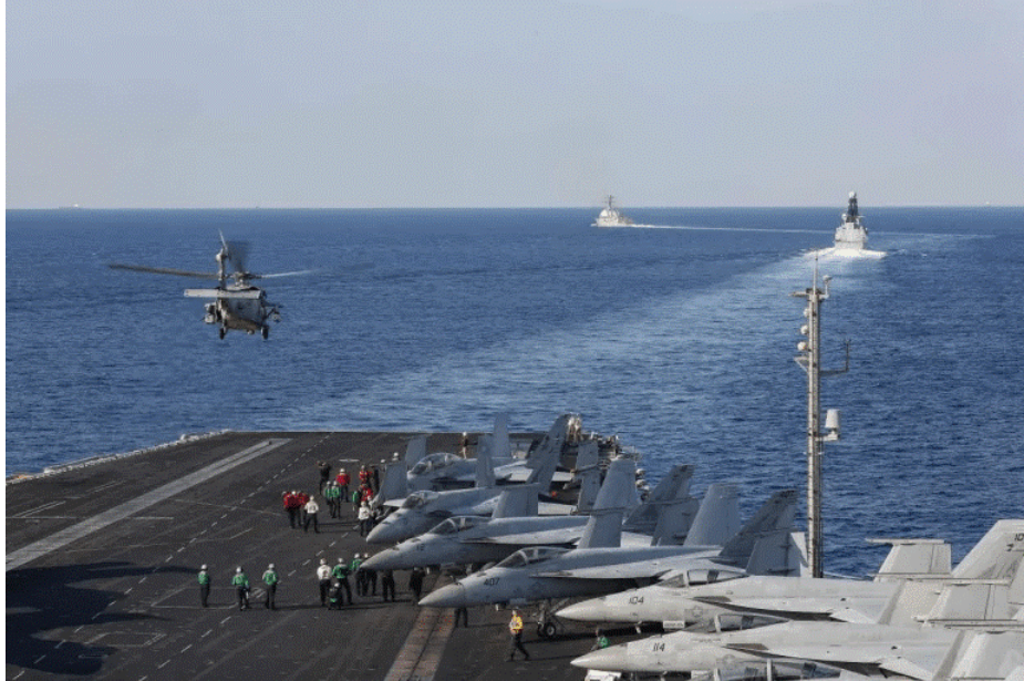
An MH-60S Sea Hawk helicopter lifts off from the flight deck of the aircraft carrier USS Abraham Lincoln as it transits the Strait of Hormuz off the waters of Iran

Netanyahu has been trying to drag the U.S. into its ongoing ‘shadow war’ against Iran for decades. The U.S. wants its war with Iran but on its own terms, economic isolation, limited proxy engagements, shots across the bow, tepid challenges for sea lanes. None but the most flagrant neocons want tit-for-tat sparring to escalate to full blown and potentially nuclear warfare. Yet today sectors of the Israeli establishment seriously consider the Samson Option . The west holds its breath as Netanyahu’s war cabinet considers its options.