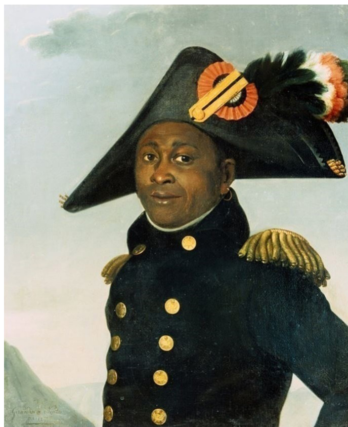
Toussaint Louverture, leader of the Haitian Revolution

Haiti is the historic expression of naked capitalist barbarism from colonisation in the 15th C to its terminal crisis today. It turns the imperialist narrative of the civilizing mission